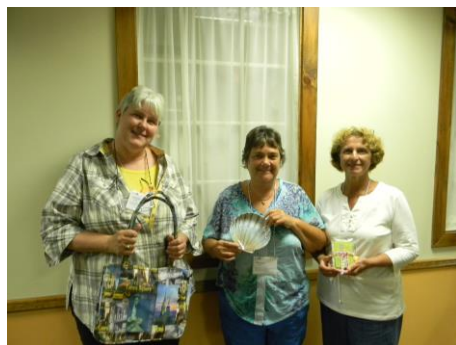
Our Card Playing Champs!