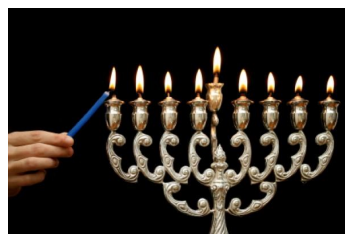
Hanukkah Starts at Sunset December 6 through December 14