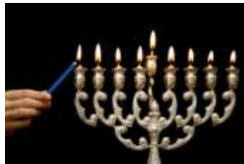
Hanukkah Starts at Sunset December 24 through January 1