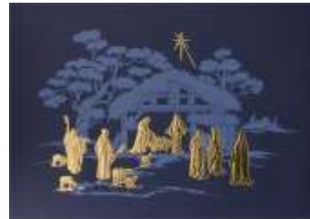
Christmas December 25